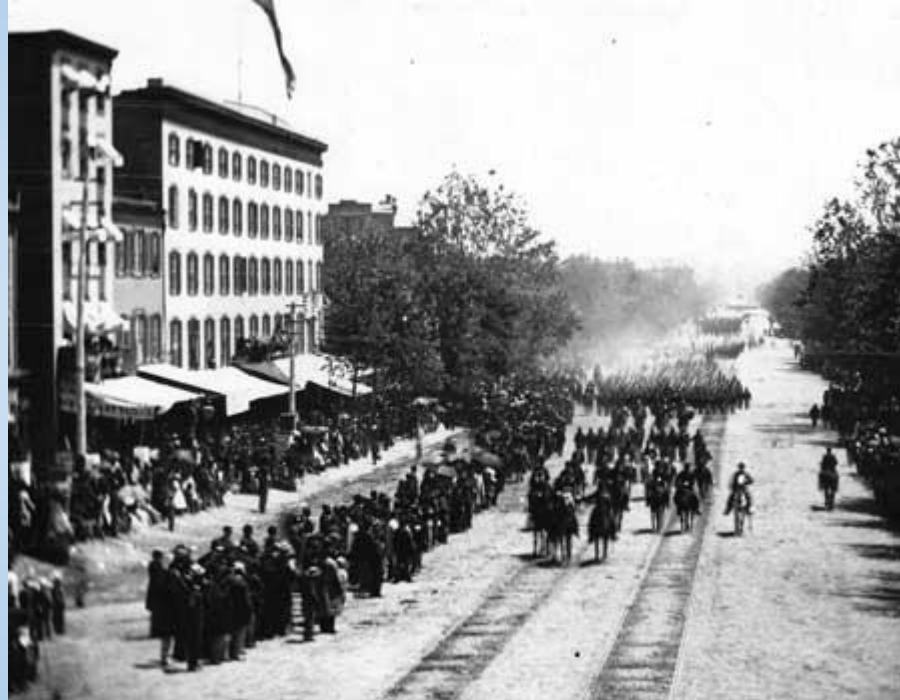
U.S. Military army