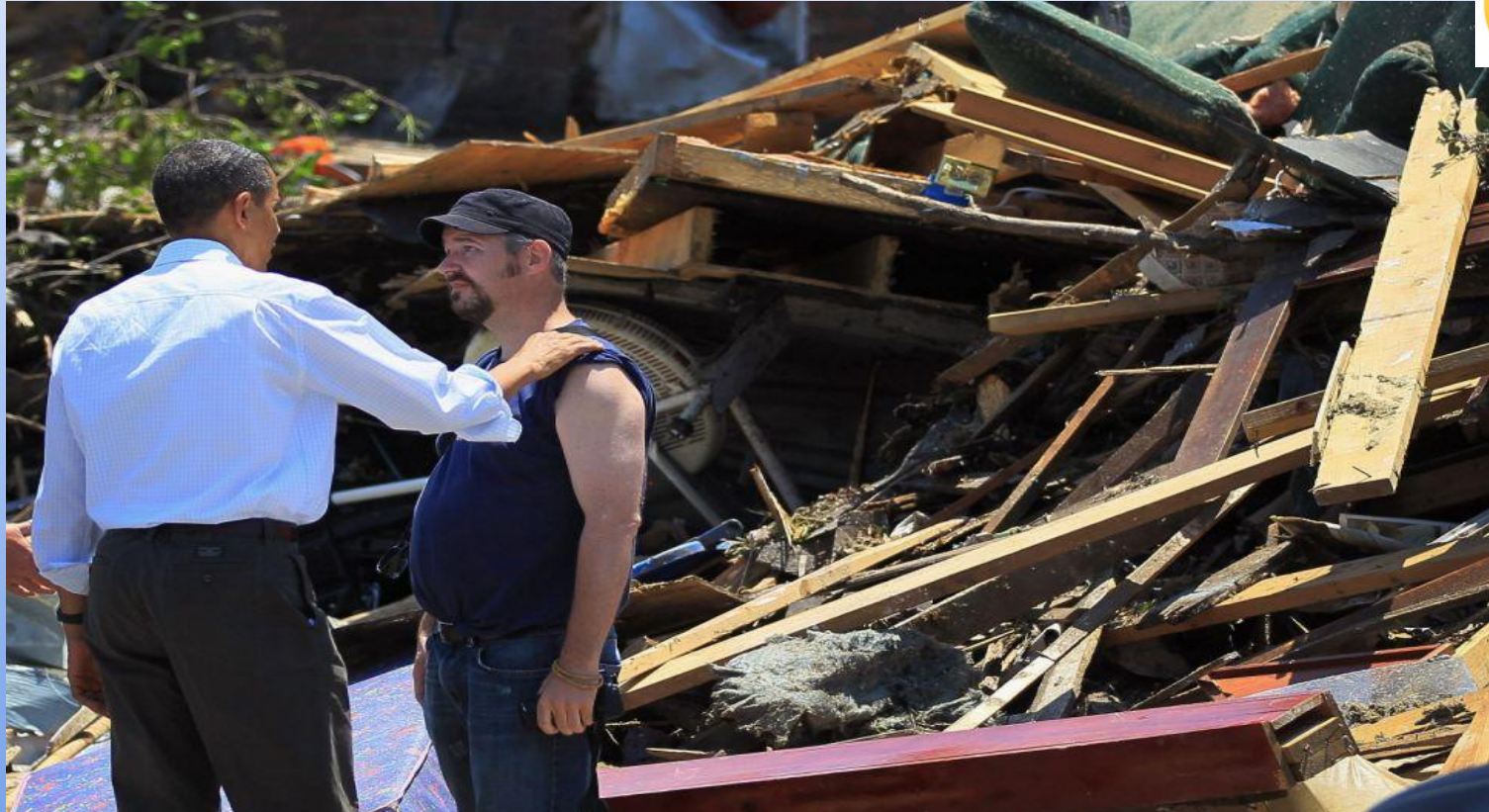
President Obama helping people in Joplin, Missouri affected by a twister